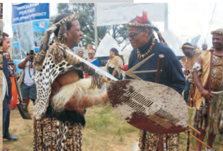
iSilo Samabandla sikanye no Mntwana wakwaPhindangene onguNdunankulu womdabu weNgonyama aphinde abe uMongameli weqembu le IFP emgubweni wempi yase Sandlwane