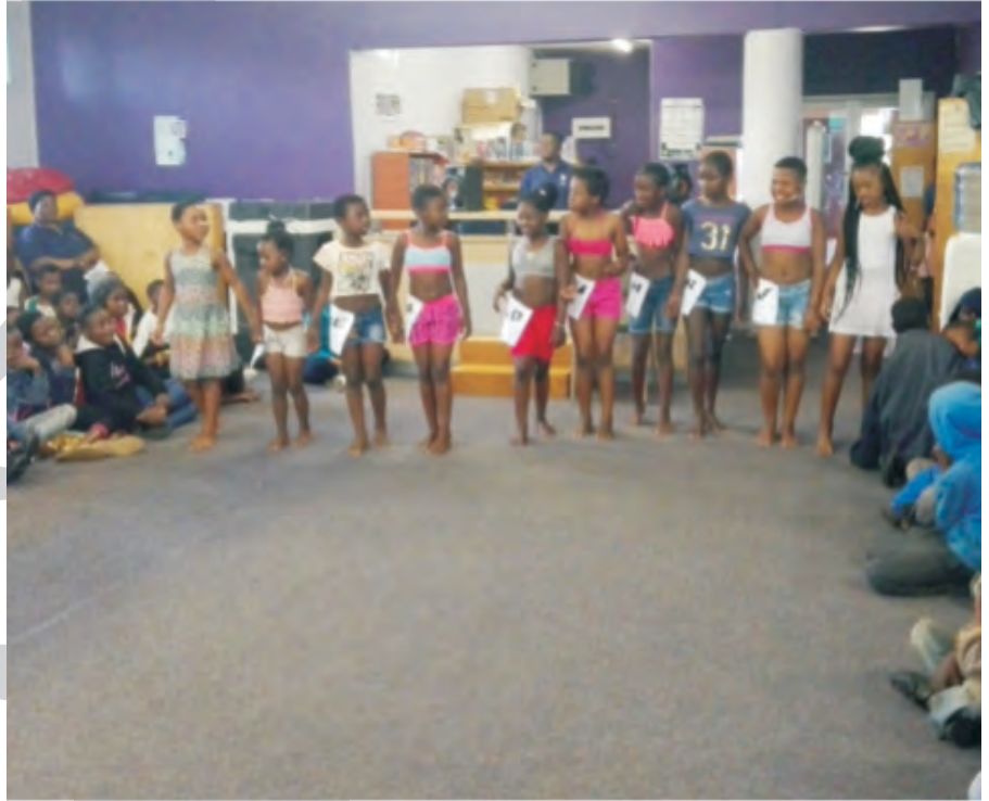
Abantwana abebambebele umcimbi obuse Nquthu Library lapho bebedlala khona imidlalo eyahlukene baphinde bafundiswa nangokubaluleka komtapo wolwazi. Lapha bebedlala umncintiswane wonobuhle

Minyaka yonke lomcimbi uhanjelwa nangabazali bezoxhasa abantwana babo . Abazali bebe kikiza bejabule , behalalisela abantwana. Abazali baphinde bazwakalisa okukhulu ukujabula lapho bebonge khona uMkhandlu ngokuhlala ukhumbula abantwana babo umasekusondele isikhathi samaholide kakhisimuzi