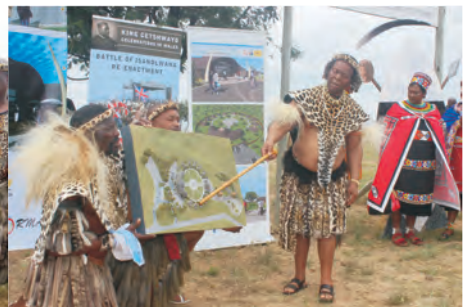
iSilo Samabandla sikhombisa izicukuthwane ebeziyinxenye yokugujwa kwempi yaseSandlwane isakhiwo samagugu esizokwakhiwa khona eSandlwane