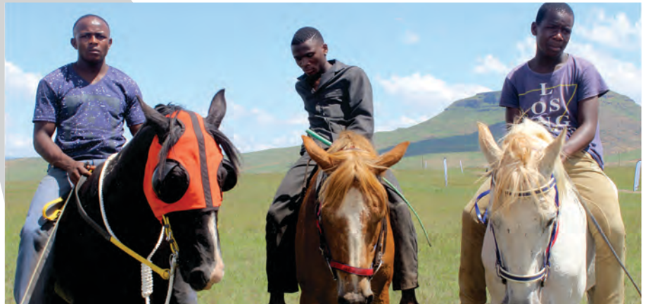
Abagibeli bamahhashi o jokhi bekanye namahhashi abo emva kokugijima

“ izingane zethu umakuvalwe izikole zichitha isikhathi sazo esiningi zizilungiselela lemicimbi lokho okwenza zisizakal ngokuthi