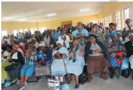
Ogogo nomkhulu ababuya kuwona wonke amawadi ongu 17 ase Nquthu bethamele umcimbi wabo e Mpumelelweni Hall. Iapho bebekikiza becula amaculo ehlukeni bejabulela isipho esiyinqayizivele abasilethelwe umkhandlu, Sodolobha kanye namakhaseka.

Lomcimbi udle umkhandlu isamba semali esilinganiselwa ku R228 000.00. Usodolobha kanye namakhansela babe sebedlulisela ukhisimuzi kogogo.