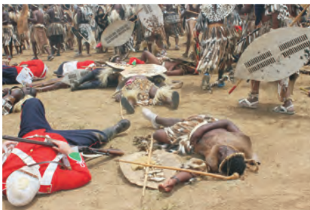
kungenkathi aMaZulu namaNgisi belingisa okwenzeka ngo nyaka ka 1879 , lapho ingisi noMzulu babebhekene ngezikhali , lapho kweanqoba khona aMaZulu.

Umdlakobhane ube esephendula isoyi lapho kuzokwakhiwa khona isakhiwo sesintu . Waphinde wathula nenkontileka ezokwakha. Uphinde wanxusa nabanye osomabhizimisi ukuthi basondele bafake isandla.