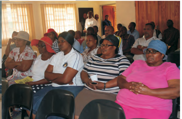
inxenye yamalunga omphakathi wase Ward 14, edolobheni ethamele umcimbi wokuhlaba isoyi lomgwaqo ozofakwa itiyela Mgazi High School.