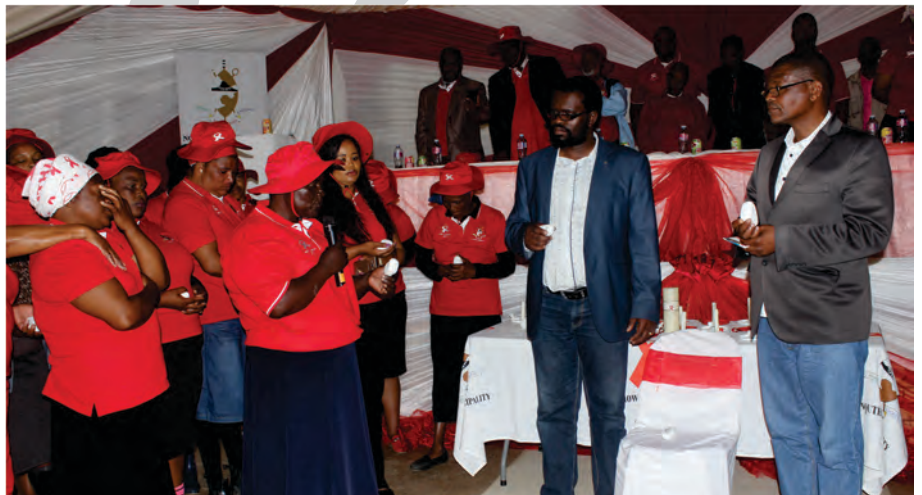
Kungesikhathi kukhunjulwa izihlobo esezadlula emhlabeni ngenxa yaso lesisifo.