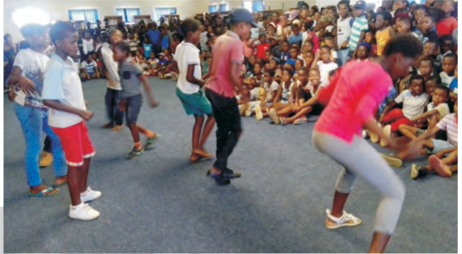
osisi no bhuti abancane beziphula kudlala ingoma emcimbini obukade use Nondweni Library.

abantwana baphinde bafundiswa ngokubaluleka kokufunda izincwadi kanye nokusebenzisa imitapo yolwazi phecelezi (libraries) ukuze bazozithuthukisa ngolwazi. Baphinde bayalwa ukuthi njengoba kuyiwa esikhatghini samaholide baziphathe kahle bangabi uvanzi emigwaqeni ukuze bezokwazi ukuthi baphephe ezingozini bazokwazi ukuthi babuye babuyele ezikoleni bephephile.