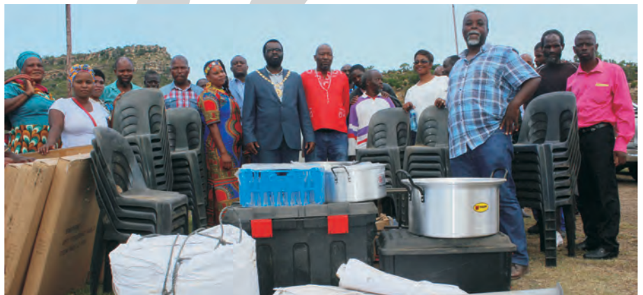
uSodolobha wase Nquthu ne Nkosi yesizwe yakwa Sithole eQhuden i amakhansela Kanye namalunga omphakathi bezomukela izinsiza kusebenza abazithelwe uSodolobha ngaphansi kokhelo le Poverty Alleviation .