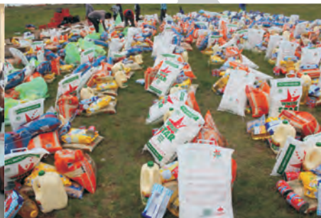
Izindodla zokudla u Sodolobha womkhandlu kanye namakhansela abezokudlulisela koGogo njengo khisimuzi wabo . abazoxosha ngakho ikati eziko ngesikhathi samaholide kakhisimuzi bezijabulisa kanye nabazukulubabo njengabonke abantu kulesisikhathi sonyaka.