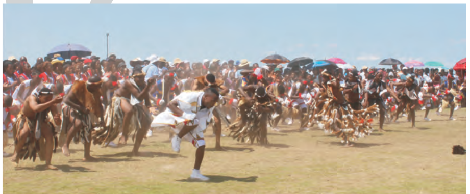
Bekudela umakhasana zigadulisana kanjena eNgomeni ebibanjelwe e Nquthu Stadium ebibanjelwe izinkumbi zabantu mhlazingu 24 December.