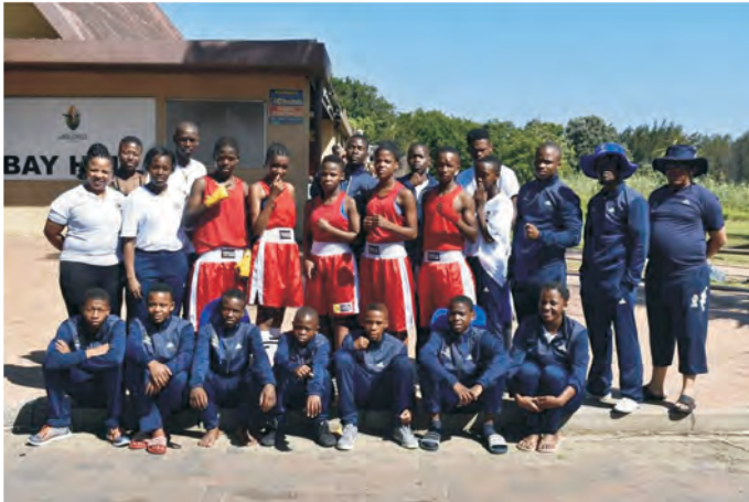
Iqembu lamanqindi ( Boxing) laseMzinyathi eligile izimanga kowama SALGA lazi dlala amahlanga njengenjwayelo lazelaphinde laziwinela indebe yokuthi selidlale iminyaka emihlanu lingadliwa.