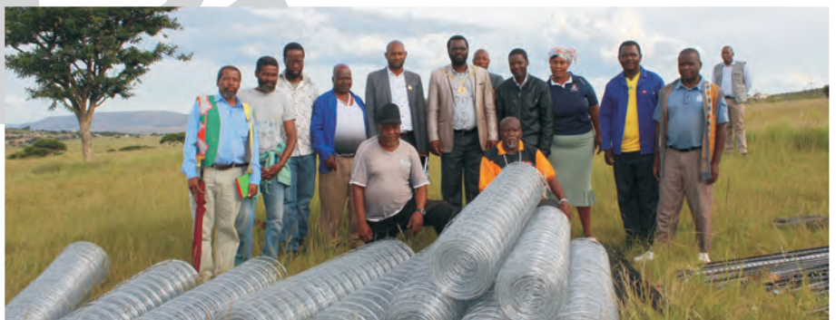
Abejabule eqhuma amalunga omphakathi wakwa Ward 10 ezozimukelela wona mathupha ucingo lokubuya izingadi ku Sodolobha kanye namaKhansela .