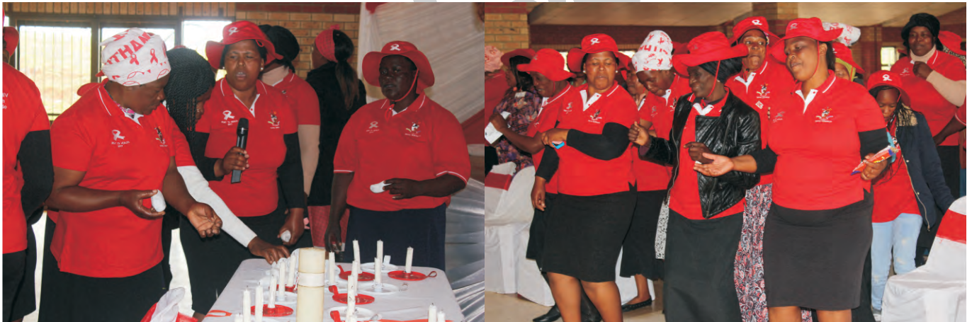
lapha kungesikhathi kukhanyiswa amakhandlela okukhumbula izihlobo esezahamba emhlabeni ngenxa yaso lesisifo .

Lomcimbi ube usuvalwa ngenkulu imfudumalo lapho bekuhlatshelelwa izingoba ezahlukehlekela kuqholoshwa kuqhuma nemikiziko.