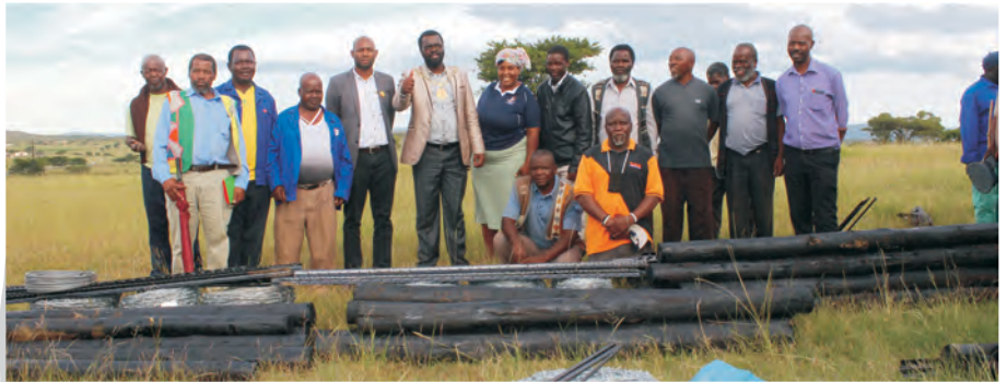
izincingo kanye nezinto zokubuya izinkambi okunikelwe kwa ward 10 u Sodolobha ehamba namakhansela.

ukuthuthukisa abantu kuwumsebenzi okumele wenziwe ngokubambisana phakathi komphakathi, uhulumeni kanye nomkhandlu.