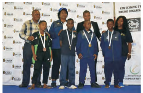
ubuzidlela amahlanga nje uMzinyathi Ku Boxing

Lemidlalo idlalwa abantu abaneminyaka engu 19 kuyaphansi. Eqenjini lesifunda saseMzinyathi , inquthu ibimelwe abadlali abangu 30. Isifunda saseMzinyathi singenele imikhakha eyisithupha okubalwakuyona ibhola lezinyawo, amanqindi, ibhola lombhoxo, umgijimo, ibhola lomqakiswa Kanye nebhola lomphebezo(Volley Ball) Isifunda saseMzinyathi senze ezibukwayo kulemidlalo lapho abesifazane bebhola lombhoxo bequbuye indebe kwathi abesilisa bazitholela I bronze,