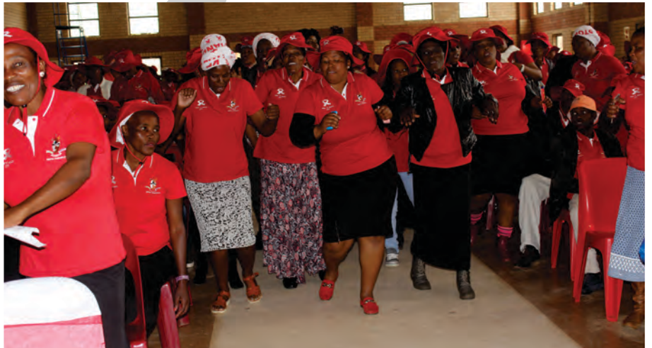
wasala wena , bekungadlaliwe lapha izintokazi sidansa zishayela phezulu