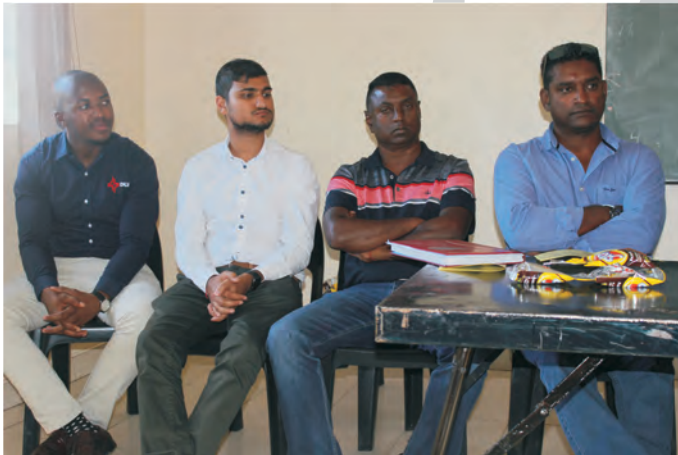
Osonkontileka Kanye nama consultants abazofaka itiyela emigwaqeni wase dolobheni .

Usodolobha uphinde wethula inkontileka ezokwenza umsebenzi wokudweba olayini emigwaqeni esodolobheni nokuzothi uma kuphela kuzobe sekubeka uMkhandlu esimweni sokuthi ukwazi ukuhlolola ukuthatha izincwadi zokushayela kubantu base Nquthu, kanti ngokunjalo uphinde washiya nenyi inkontileka ezokwakha izimpawu ezikhombisa ukuthi ususedolobheni eNquthu, kukonke lokhu kusho ukudala amathuba emisebenzi kuZakhamizi zakwa ward 14.