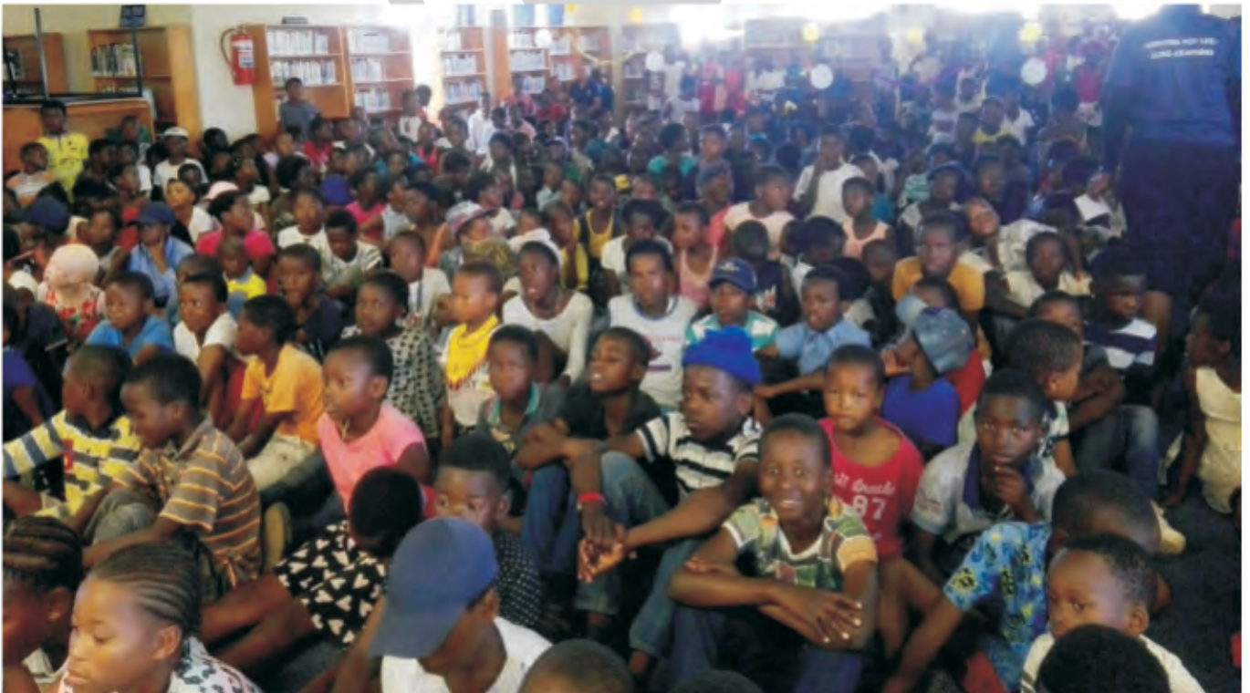
Abantwana base Nondweni abebambebele umcimbi wabo obubanjelwe e Nondweni Library lapho bezidlalele khona imidlalo eyahlukene baphinde bathola ukufundiseka ngokubaluleka komtapo wolwazi.